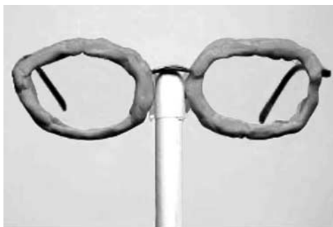
Figure 2 Tac 'N Stik® reusable adhesive around the edges of the eyeglasses used to prevent unmasking.

To assess the success of masking we asked the examiner to report what treatment he/she thought the child had received or if he/she was unsure. This question was asked after testing with the assigned reading glasses was completed. In addition, the children and parents were asked which treatment they thought they had received or if they did not know. The